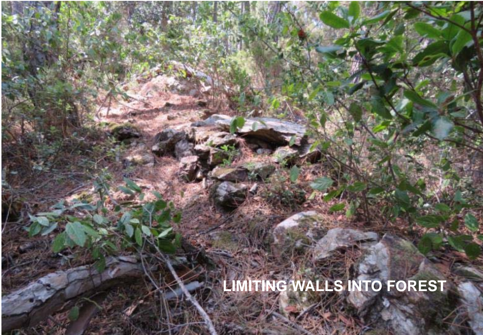
LIMITING WALLS INTO FOREST